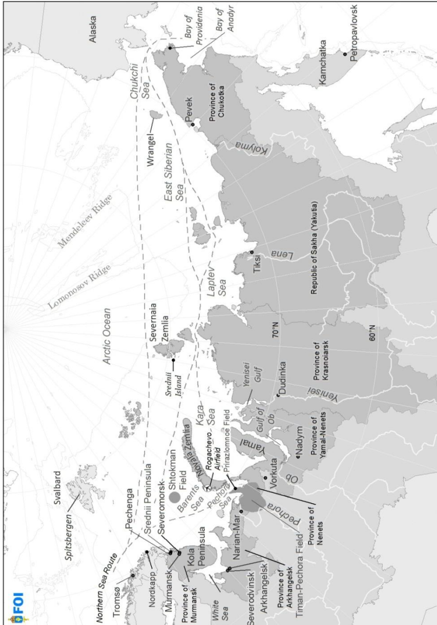
Figure 1 Map over the Russian Arctic